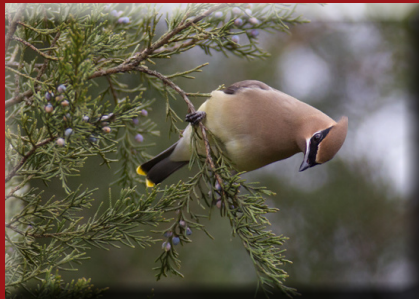
Cedar Waxwing