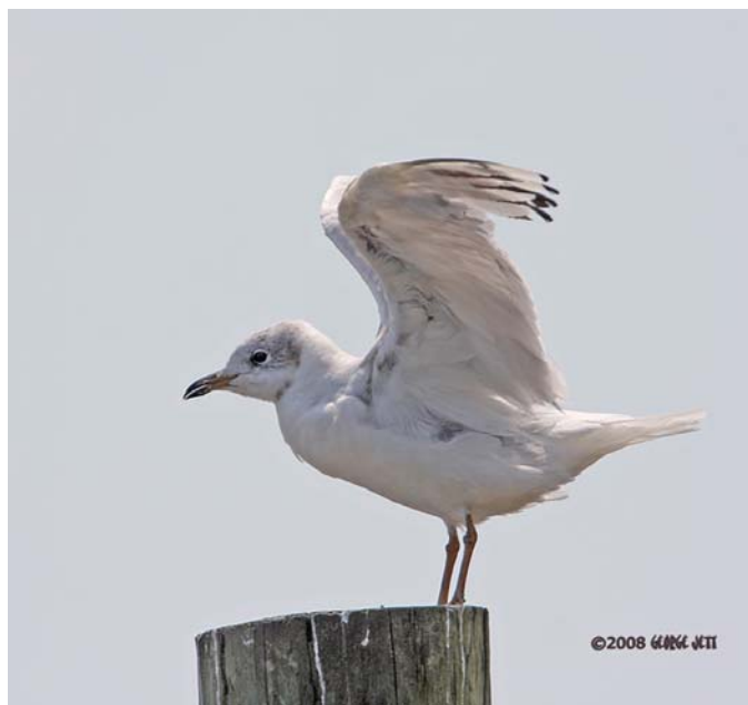
Possibly a hybrid Black-headed X Ring-billed Gull, photographed by George Jett 17 August near Eagle Harbor.

We were happy to see the real McCoy as Black-headed Gull was a new bird for us in Maryland. We've seen them before, twice, in Delaware (once on a SMAS trip we were leading) but they had escaped us in Maryland. We took many photos using a 300mm lens which wasn't nearly enough magnification. Jane suggested putting the camera up to the lens of our Leica spotting scope. The results were much better than either of us imagined. However, one must be careful to clean the eyepiece before attempting this as every dust mote shows clearly in the photos!