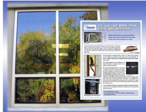
You Can Save Birds From Flying Into Windows.

(Washington, D.C., March 25, 2010) American Bird Conservancy (ABC) has just published a new, downloadable brochure ( www.abcbirds.org/abcprograms/policy/collisions_flyer.pdf ) that offers a variety of tips on how to reduce the chances of birds flying into home windows and glass doors. Scientists estimate that 300 million to one billion birds die each year from collisions with glass, the majority of which is on homes.